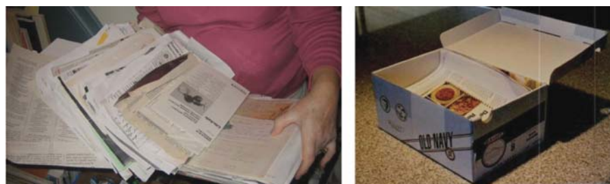
Figure 5. Unclassified recipe collections: in a folder (left); in a shoe box (right)

Recipe collections may not be classified or ordered at all, such as those shown in Figure 5. Some cooks find the idea of rigorous organization overwhelming and are not concerned about a lack of reliable access to their recipe collections, which are relatively small, familiar, and navigable. Such nonchalance may also exist because gourmet