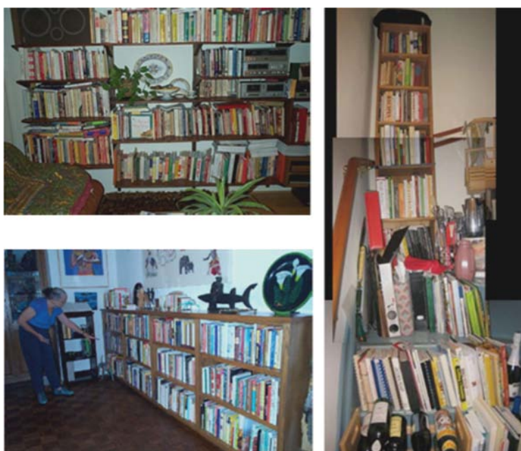
Figure 3. The mother lode (clockwise from top left): Dorene’s wall of cookbooks; Roland’s unique cache in a staircase; a section of the mother lode in Patty’s study

The mother lode plays multiple roles in the hobby. It is one of the first repositories consulted during a berrypicking-style search for recipes (Hartel, 2007, p. 157; Bates, 1989). At the same time, a distinct feature of the mother lode is that most of its materials are rarely if ever used (other resources, presented shortly, are more heavily used.) As a cook acquires more and more items, the opportunity for time with any one necessarily decreases; the majority is left untouched for long periods (like most books in the stacks at public or academic libraries). This suggests that hobbyists with medium to large PCLs may be more interested in owning culinary information, than using it. Owned books have important symbolic and aesthetic values. They present a snapshot of the cook’s experience in the hobby and announce the cook’s passion and talent to anyone who enters the home. Further, most collections are beautiful and interesting to behold, adding character and intelligence to the residence and daily life.