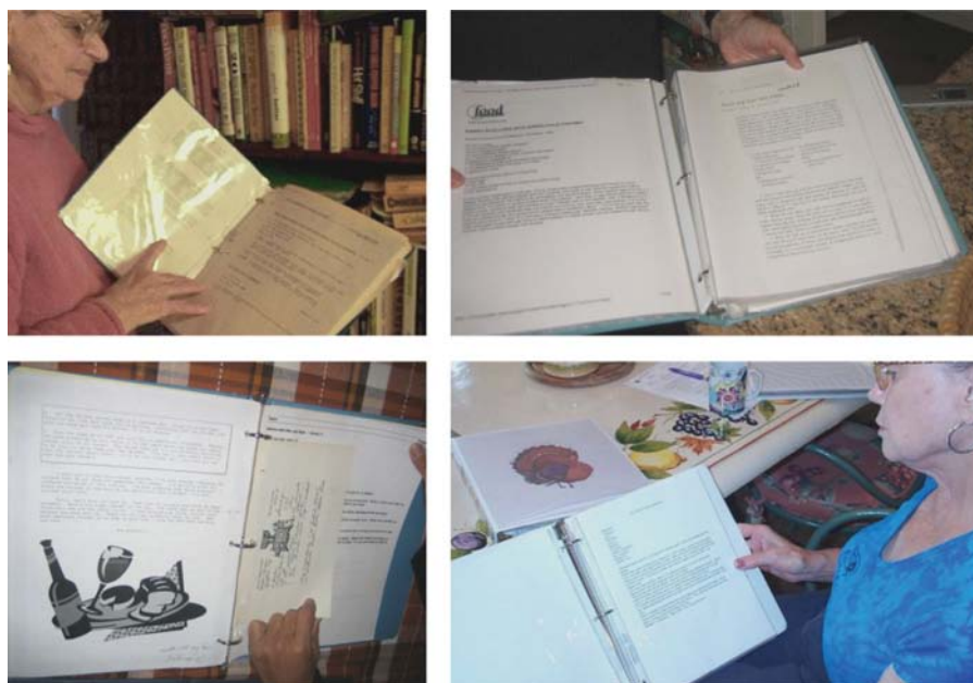
Figure 6. Examples of the binder (clockwise from top left): binders by Dorene, Celeste, Patty, and Rose

One of the primary functions of the larger PCLs is to facilitate the discovery of keepers for addition to the binder. An example of the path of a winning recipe through the system (the bibliographic pyramid) is as follows. A cooking magazine enters the home as a routine monthly acquisition for the mother lode. While new to the collection it is placed on a coffee table, a browsing zone. Soon thereafter, a recipe is flagged as promising, ripped out, and placed in a different zone, a collection of promising recipes. The recipe further piques the cook's interest while planning a cooking episode and is added to the menu of an upcoming cooking project. If the recipe delivers great results, then it is tweaked (if necessary) and added to the binder for future re-use. (If the results are not so impressive, the recipe is probably discarded.) In this way, the binder is the capstone of the pyramid and a critical sample and survey akin in many ways to a scholarly literature review. However, unlike a literature review that covers a time span, the binder remains perpetually a work-in-progress underlying the hobby career.