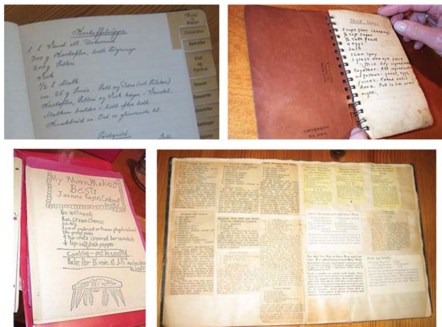
Figure 1. Examples of culinary keepsakes

A comprehensive material survey of the PCL must include common non-culinary and non-textual items, to avoid a rarefied conception. Hobbyists can be nonchalant about the composition of their libraries, and in many cases, culinary information kept close company with unrelated topics, such as phonebooks and old college textbooks. Out of necessity, information resources were kept in housing such as bookcases, built-in shelves, file cabinets, desks, countertops, coffee tables, pedestals, bins, boxes, and personal computers. Many PCLs contain cooking paraphernalia like utensils, cookware, and ingredients. Finally, décor expresses personal style: knickknacks, artwork, and photographs appear throughout.